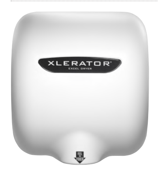
XL-BW White Thermoset Resin (BMC)